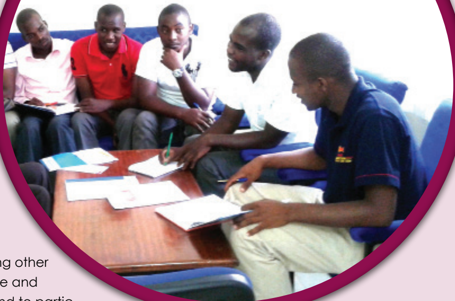
Interim officials of PU Alumni at a past meeting

The Alumni Association, among other activities, supports the welfare and progress of Pwani University and to participate in the enhancement and improvement of intellectual and material well being of Pwani University community.